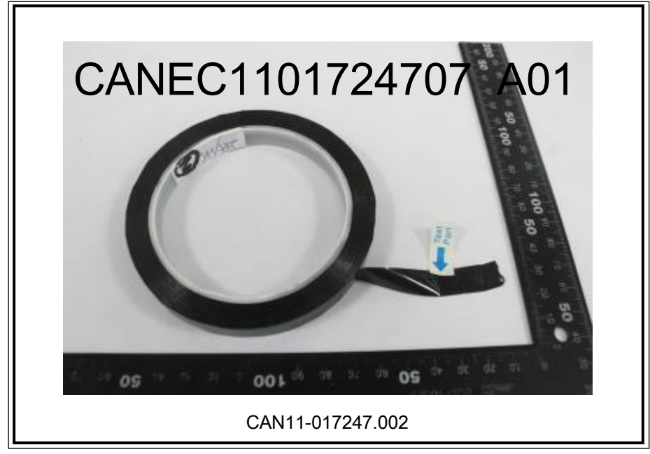
SGS authenticate the photo on original report only *** End of Report ***

This document is issued by the Company subject to its General Conditions of Service printed overleaf, available on request or accessible at http://www.sgs.com/terms_and_conditions. htm and for electronic format documents, subject to Terms and Conditions for Electronic Documents at www.sgs.com/terms_e-document.htm. Attention is drawn to the limitation of liability, the terms and conditions for Electronic Documents at www.sgs.com/terms_e-document.htm. Attention is drawn to the limitation of its incommute interment of the terms and conditions of the document is advised that information contained hereon reflects the Company's findings at the time of its incommute interment of the terms and obligations under the transaction documents. This document cannot be reproduced except in full, without prior written approval of the Company. Any unauthorized alteration, forgery or falsification of the content or appearance of this document is unlawful and offenders may be prosecuted to the fullest extent of the law. The sample is the time of the sample(s) tested .